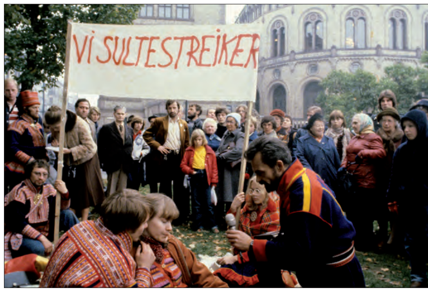
Demonstration on Sámi (indigenous) land rights in front of the Norwegian Parliament (1979).

Each mission should have a contact person for human rights at all times. In connection with a change of staff, arrangements should be made to ensure continuity and to maintain networks.