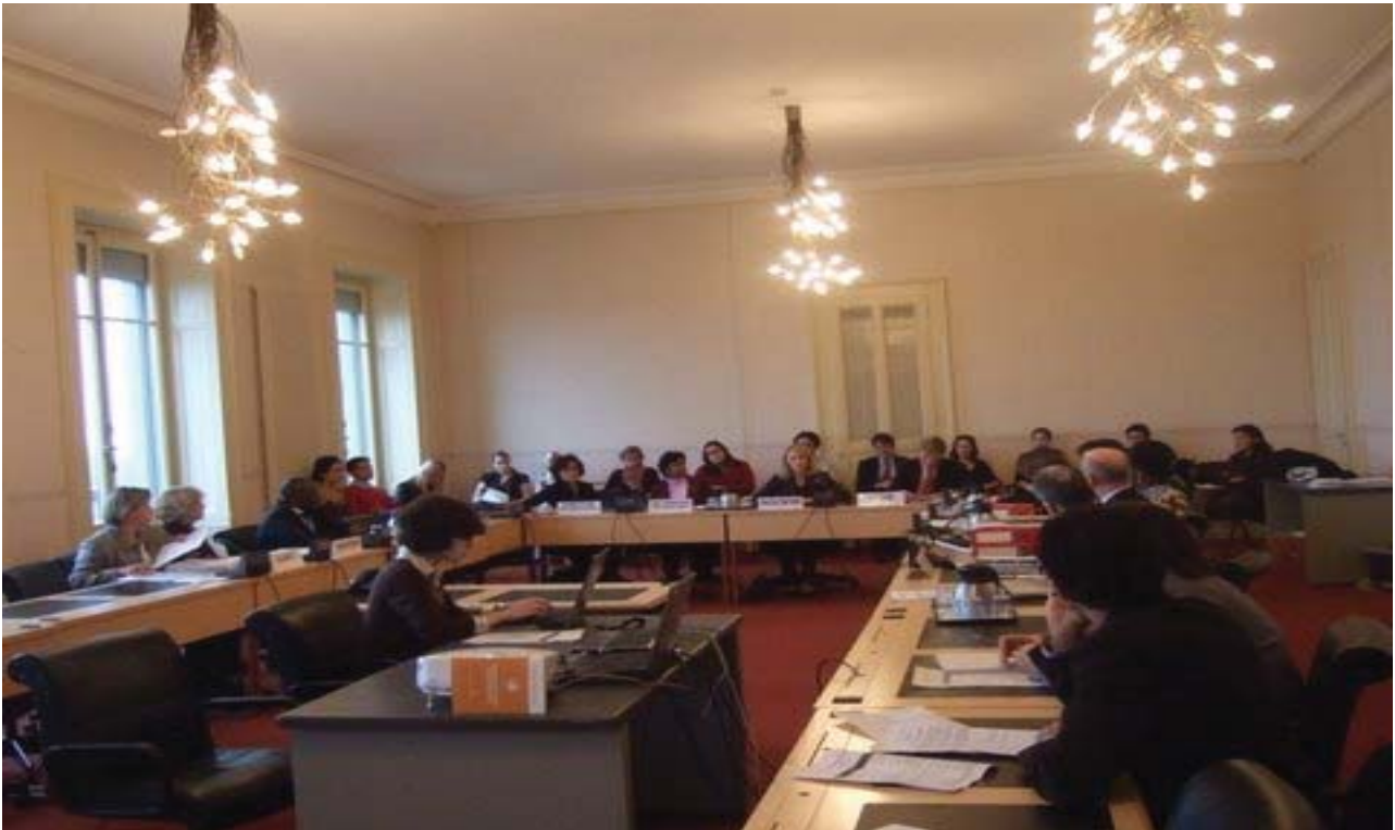
New mandate holders attending induction briefing at OHCHR Geneva, on 7 and 8 October 2008

From 7 to 8 October 2008, the Special Procedures Division organized a two-day Information session in Geneva for eleven newly appointed mandate holders. The High Commissioner, Ms. Navi Pillay, opened the session and a number of OHCHR staff members from all divisions made brief presentations on the OHCHR mandate, activities and structure. The presentations covered a wide range of topics, such as the Human Rights Council, including the Universal Periodic Review, the Durban Review Conference; the Special Procedures' working methods; interaction with treaty bodies; cooperation with OHCHR field presences and UN country teams; national human rights institutions; civil society organizations, media and other thematic, administrative and logistical issues.