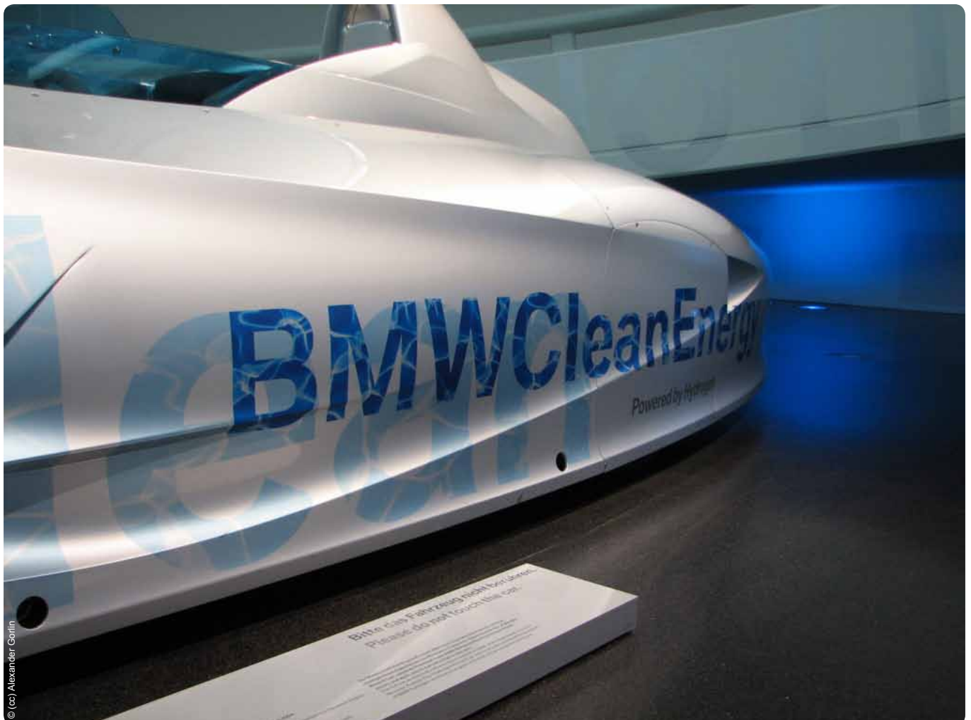
BMW showcasing hydrogen-powered concept car in the company museum in Munich, Germany.