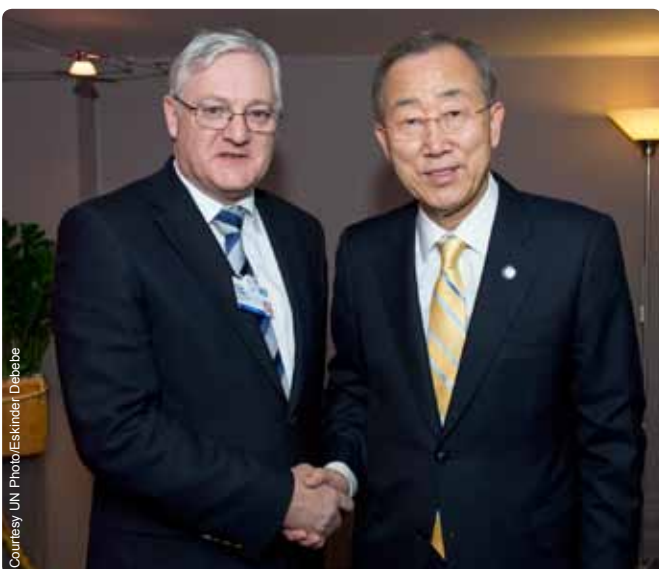
Shell CEO Peter Voser shaking hands with UN Secretary-General Ban Ki-moon.