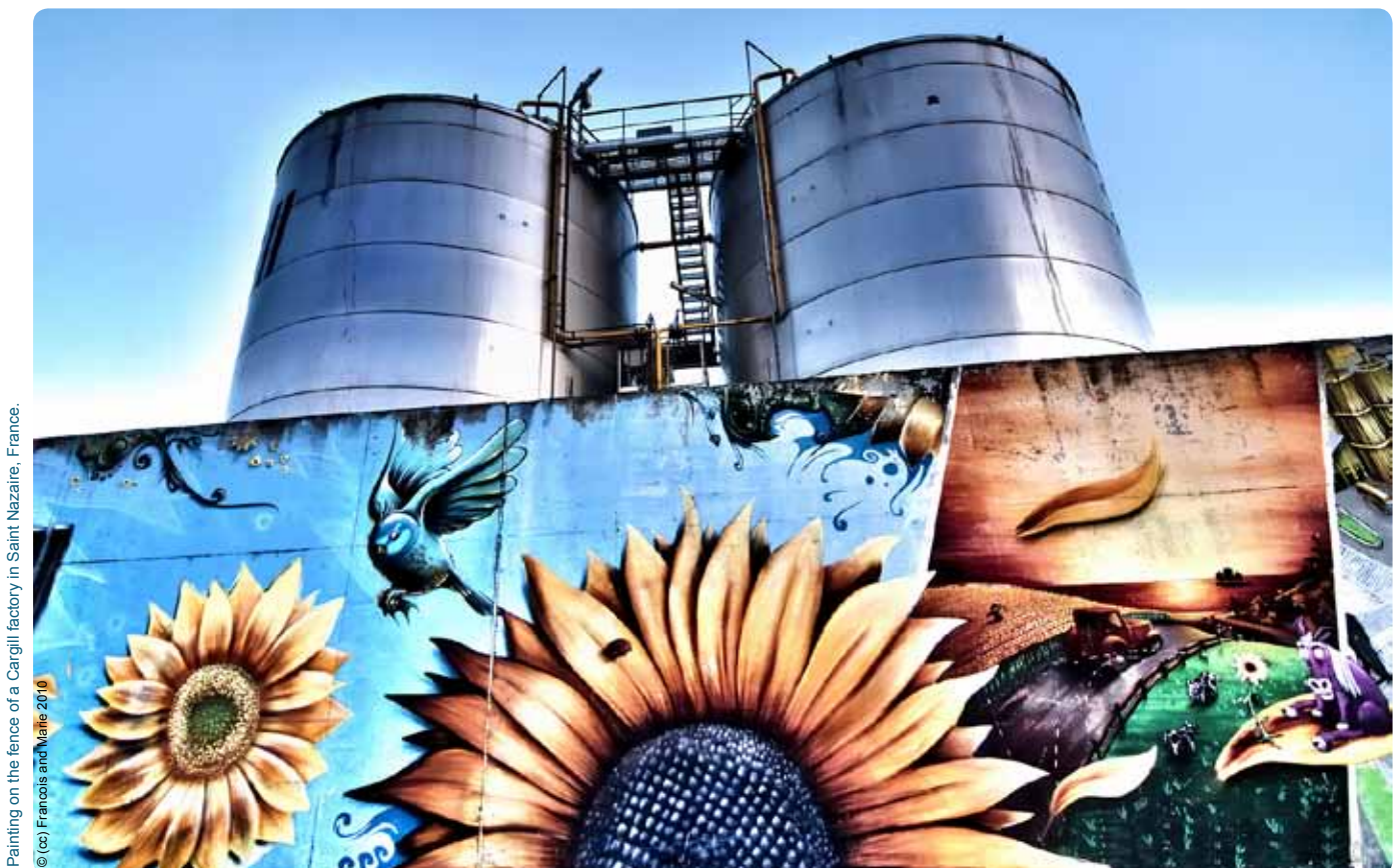
Painting on the fence of a Cargill factory in Saint Nazaire, France.